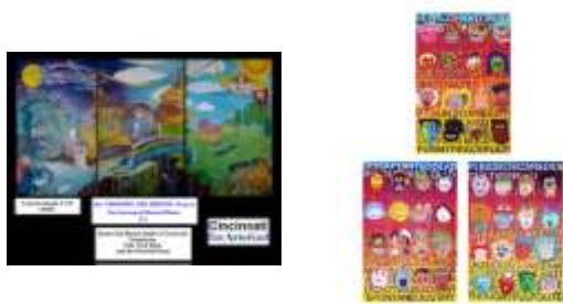
Crossing the Bridge: The Journey of Mental Wellness (left) & Mixed Emotions – A Child's Perspective on Mental Illness .

From October 9 – November 19 in the Main Library's Atrium, Library-goers can experience the intense energy that real-life recovery from mental illness brought to adults and children who experienced it through Hope and Strength Through Art: Talking About Mental Wellness . This exhibit's two large-scale, three-panel murals deliver a message of hope, strength, and, ultimately, mental wellness.