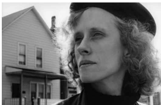
Sara Paretsky standing in front of V I’s childhood home in Chicago, Illinois.

Paretsky always enjoyed reading crime novels, but grew tired of fiction’s females using their bodies to “get good boys to do bad things.” She wanted to create a real woman—a smart and effective problem solver whose sexuality only made her more human, not evil or manipulative. That vision spawned the beloved V I who got an athletic scholarship to college and got beat up one-third the way through the debut novel only to survive and solve the crime at-hand.